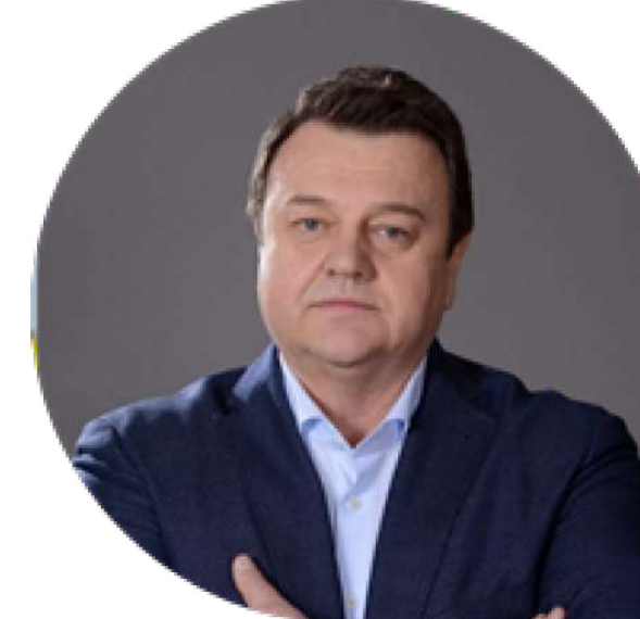
Petro Mykhailyshyn Epicentr Agro